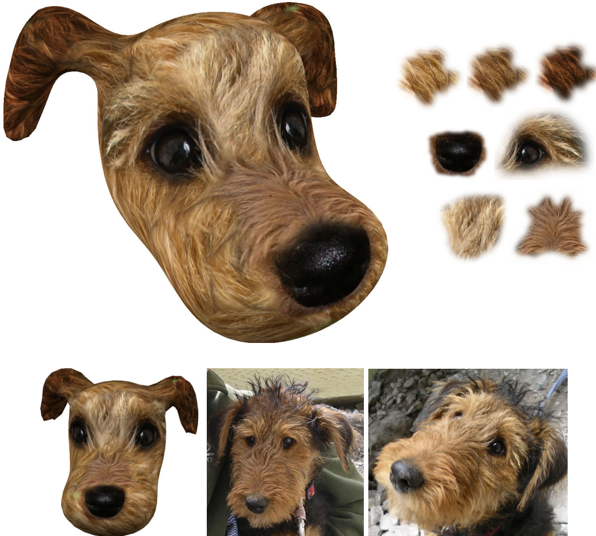
Figure 1: The base texture and feature textures for this dog were segmented from a few photographs, two are shown in the figure. Generating the lapped base fur texture takes from a few seconds to a few minutes, depending on the number of decals and the sampling rate of the underlying point set. The eyes, nose, and extra fur textures take only a minute to position. The extra fur textures (and the fur on the edge of the eyes) help break up the semi-regularity of the base texture, creating a much more compelling result.