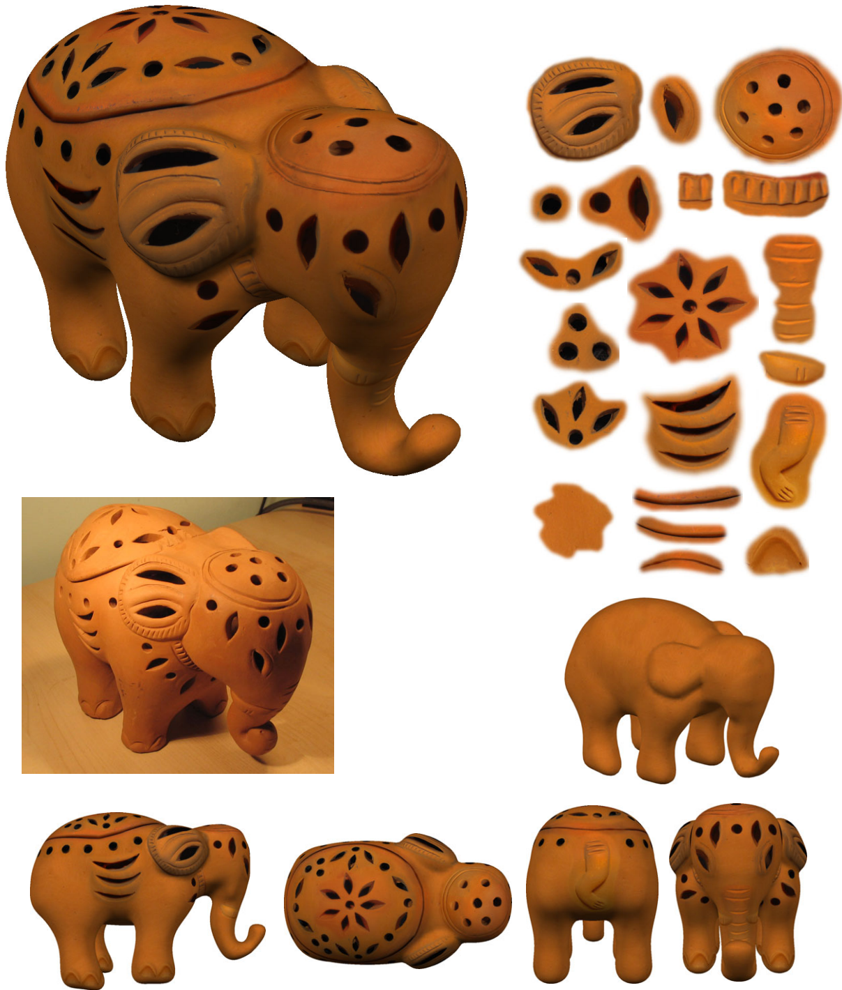
Figure 2: An implicit model of the clay elephant statuette in the photograph was created with sketch-based modeling software in under an hour. Then, photographs of the statuette were taken and from those photographs a set of feature textures were extracted (upper right). A base texture was also extracted, which was lapped to create a base model. Then the feature textures were interactively placed over the base model. Texture placement was very quick, the total time including taking photographs and cutting out the relevant features was approximately an hour. However, low lighting conditions and “automatic color balancing” hardware on the digital camera resulted in each photograph (and its feature textures) having a slightly different color balance from the base texture and each other. Manual color balancing took an additional two to three hours.