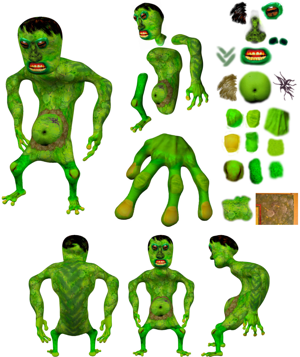
Figure 3: This implicit gremlin model was textured using the 19 images shown in the top right. The base skin texture is created by lapping an image taken from the photograph shown on the middle right. The model was textured separately in 4 parts - arm, head, body, and leg. The arm and leg were duplicated, and then the parts were assembled. Of the 392 decals used in total, 78 were manually placed, including 24 for the hand. The rest were generated automatically, either with texture lapping or by duplicating the arm and leg.